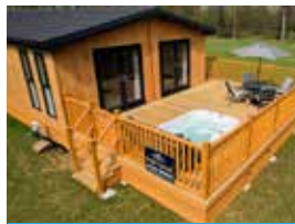
Park Realty Group Pages 8-9