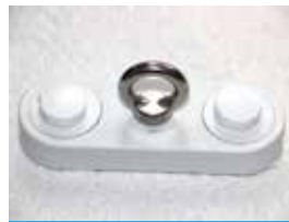
SWIFIX Pages 10-11