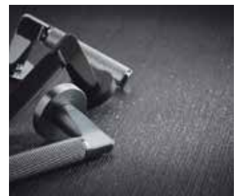
ZPA090 – Bilbao Lever

The Stanza Blue ZPA range is a new and exclusive collection of designer aluminium levers built on a zinc screw on rose or aluminium backplate and is ideal for housebuilders and homeowners alike. The full metal construction of these levers utilises quality materials at a great price without compromise, whereas inferior alternatives on the market use aluminium for both the lever and rose,