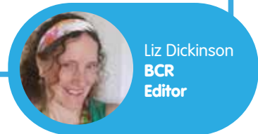
Liz Dickinson BCR Editor

Email us your construction updates at: buildings@bestpracticeuk.co.uk