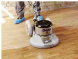
BONA Pages 6-7