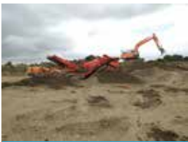
Fennell Green & Bates Pages 4-5