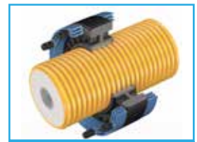
Service Sealing Solutions Ltd Page 24